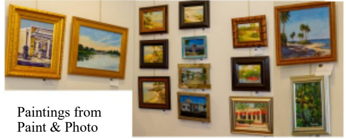
Paintings from Paint & Photo